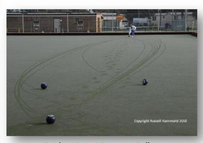
Outdoor Carpet Pre-game Roll-up