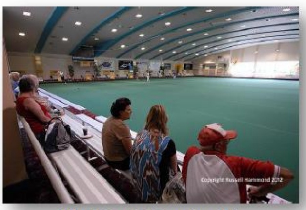
Warilla Bowls & Recreation Club