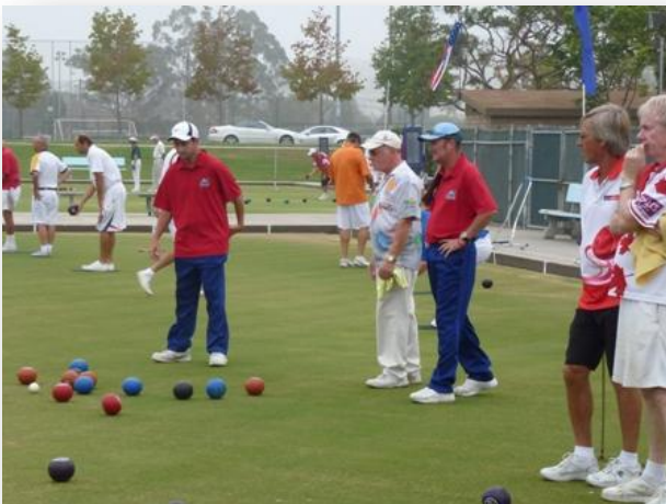
Pairs bowling at Newport Harbor LBC