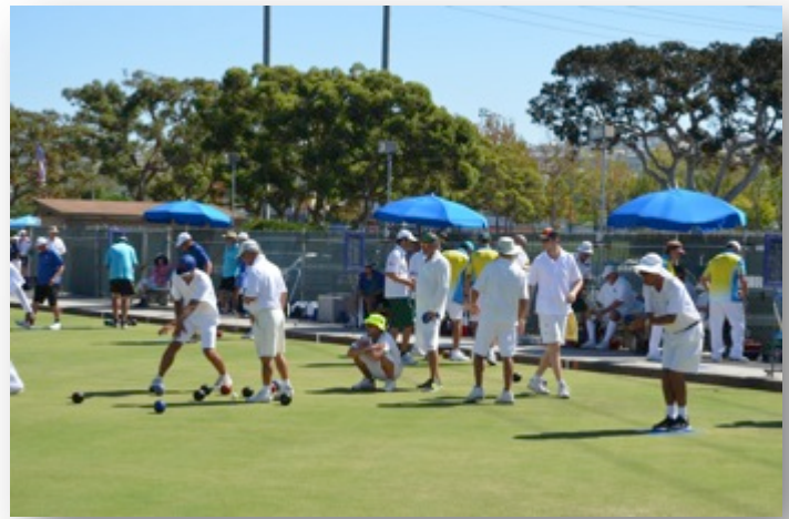
Local and international bowlers on the green at Newport Harbor Lawn Bowling Club