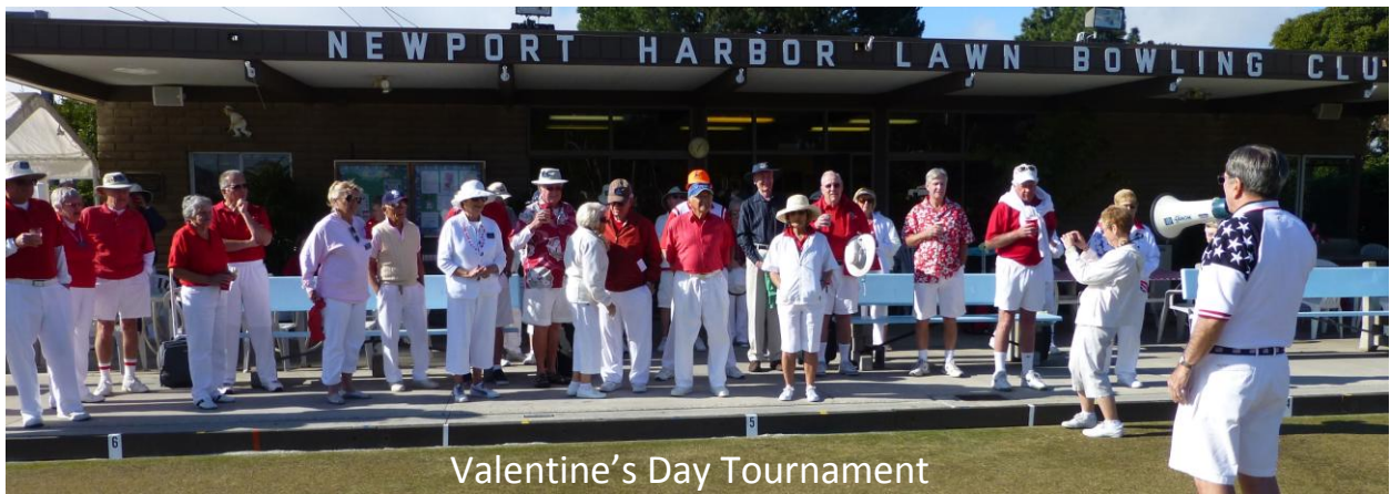
Valentine's Day Tournament