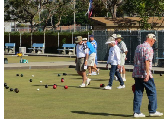
Super Bowling