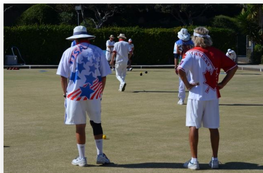
US v Canada Men's Pairs