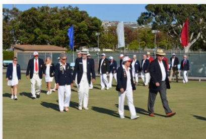
Bowls USA Officers and Councilors