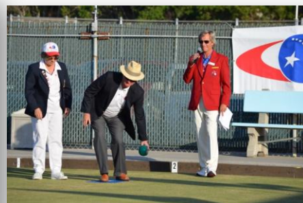
The Mayor of Newport Beach, Keith Curry bowling the first bowl of the tournament