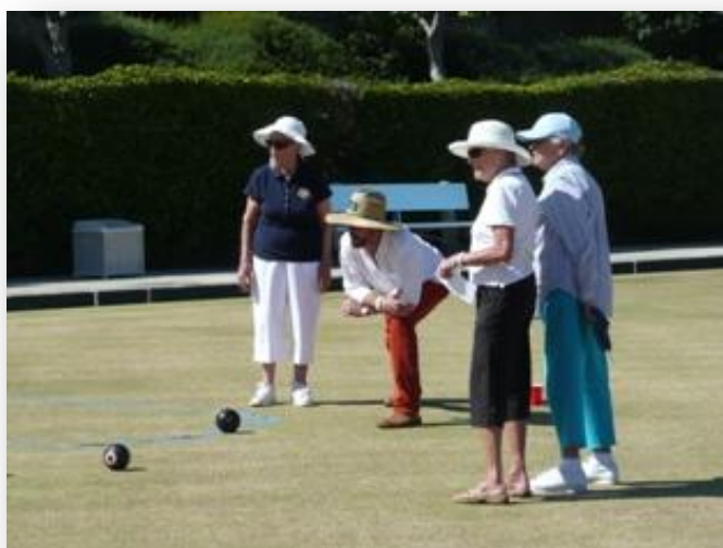
On the tee