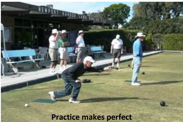
Practice makes perfect